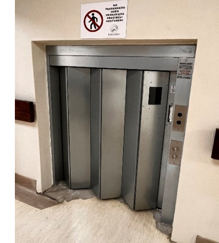
COLLAPSIBLE PANELS ON REQUEST FOR HEAVIER THAN 200KG UNIT

*All door designs are subject to confirmation from your sales technician.