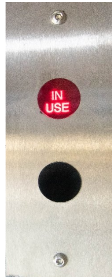
DISPLAYS IN USE AND BUSY