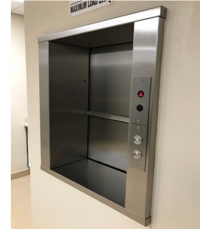
STANDARD BI PARTING DOORS IN MATERIAL CHOSEN