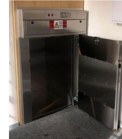
MANUAL SWING DOOR ON REQUEST