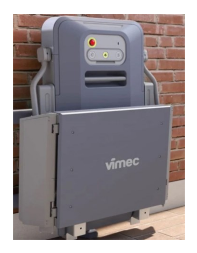
Choose a colour of your platform from our range of RAL colours to seamlessly blend the unit into your building.