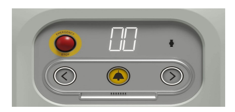
The graphic display panel will keep you up-to-date regarding the operating status of your lift and gives practical information and advice.