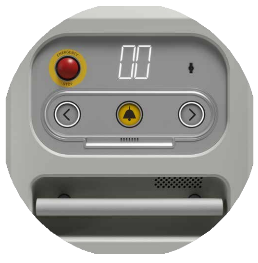
The integrated handrail blends harmoniously into the lift and has allowed us to produce a particularly slim design.