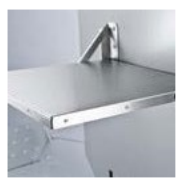
OPTIONAL FOLDING SEAT

With multiple RAL colours to choose from the client has the ability to choose their own colours.