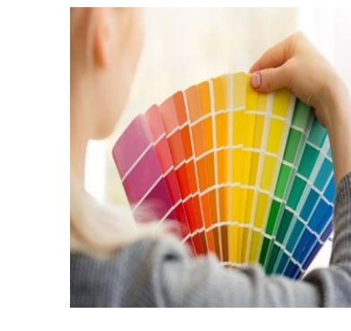
SELECTION OF FINISHES

With a push of the button you can summon the lift to the desired landing.